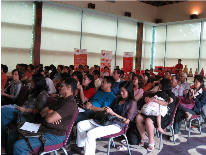
Our attentive audiences