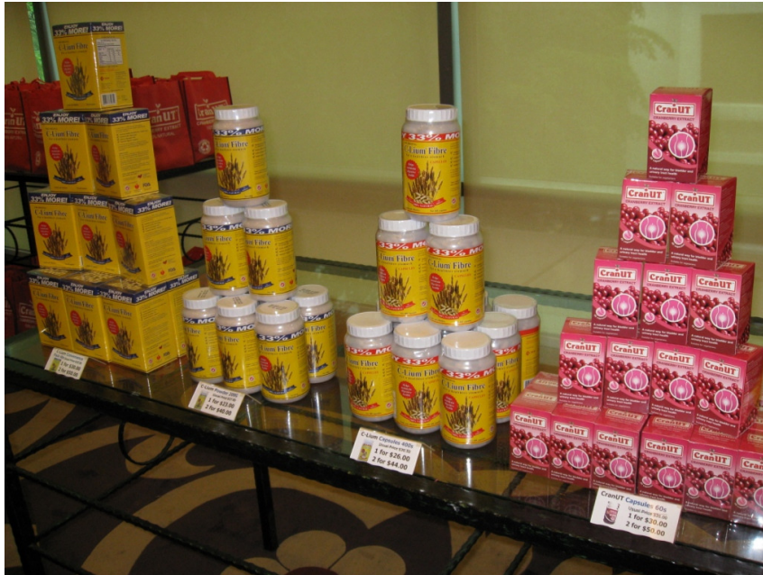
Our booth set-up